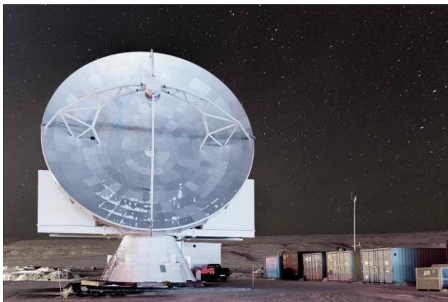
Figure 1 (left): Current image of the Greenland Telescope (GLT) at Thule Air Base, Greenland.

(Tel) +886-2- 2789-8820, chchuang@gate.sinica.edu.tw